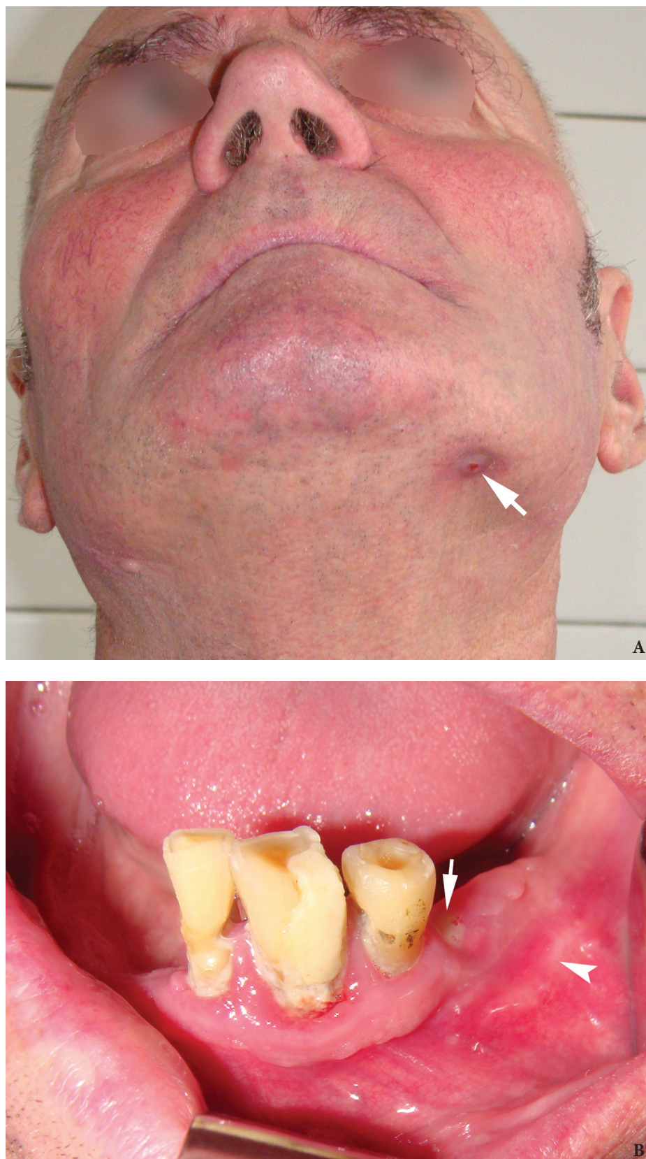
FIGURE 2. An extraoral ( A ) and intraoral ( B ) appearance of 70-year-old male with chronic odontogenic osteomyelitis of the mandible as a result of alveolitis (synonym: alveolar osteitis) after extraction of teeth 35, 36. On the image A is noted a skin fistula ( arrow ) at lower border of mandible. On intraoral view ( B ) a purulent discharge indicated by arrow , scar tissue after previously performed lancing of tissues by non-experienced surgeon – by arrowhead . Erythema of surrounding mucosa and extremely bad hygiene are also noted. ( Fig 2 continued on the next page. )