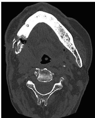
Fig. 3. Computed tomography (CT) scan of the head; transversal view. CT scan of the face, neck and chest was performed without contrast, showing pathological fracture of right jaw and periosteal reaction, besides mixed lytic and sclerotic lesion of the jaw. Massimo Viviano et al: A case of bisphosphonate-related osteonecrosis of the jaw with a particularly unfavourable course: a case report. J Korean Assoc Oral Maxillofac Surg 2017