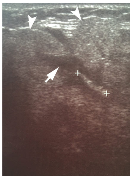
FIGURE 1. Preoperative gray scale sonogram shows an enlarged right submandibular gland ( arrowheads ) with a significantly dilated intraglandular duct system ( arrow ) and 0.8 × 0.3-cm foreign body inside, which is indicated by "+" calipers and visualized as hyperechoic linear structure without artifact of acoustic shadowing typical for sialoliths.

Preoperative ultrasonography was performed by an experienced (29 yrs) physician of ultrasound investigation (Lilia Savchuk) using 12-3 MHz linear probe (model HD11 XE, Philips). Gray scale ( synonym : B-mode) sonograms (Fig 1) showed 2-times enlarged right submandibular gland with a significantly dilated intraglandular duct system and 0.8 × 0.3-cm foreign body inside. Foreign body visualized as hyperechoic linear structure without artifact of acoustic shadowing typical for sialoliths.