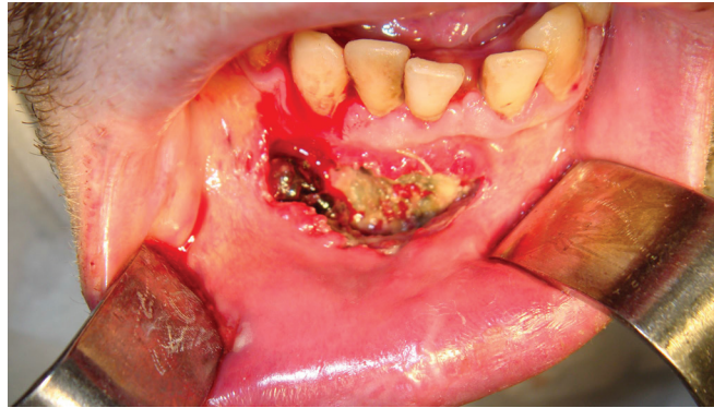
FIGURE 3. Clinical view of infected wound of oral vestibule 3 days after its primary surgical debridement. Sutures fail, suppuration with tissues necrotizing are observed because of violation of the surgeon's recommendations by the patient (rejection of antibiotics, bad oral hygiene, and alcohol abuse).