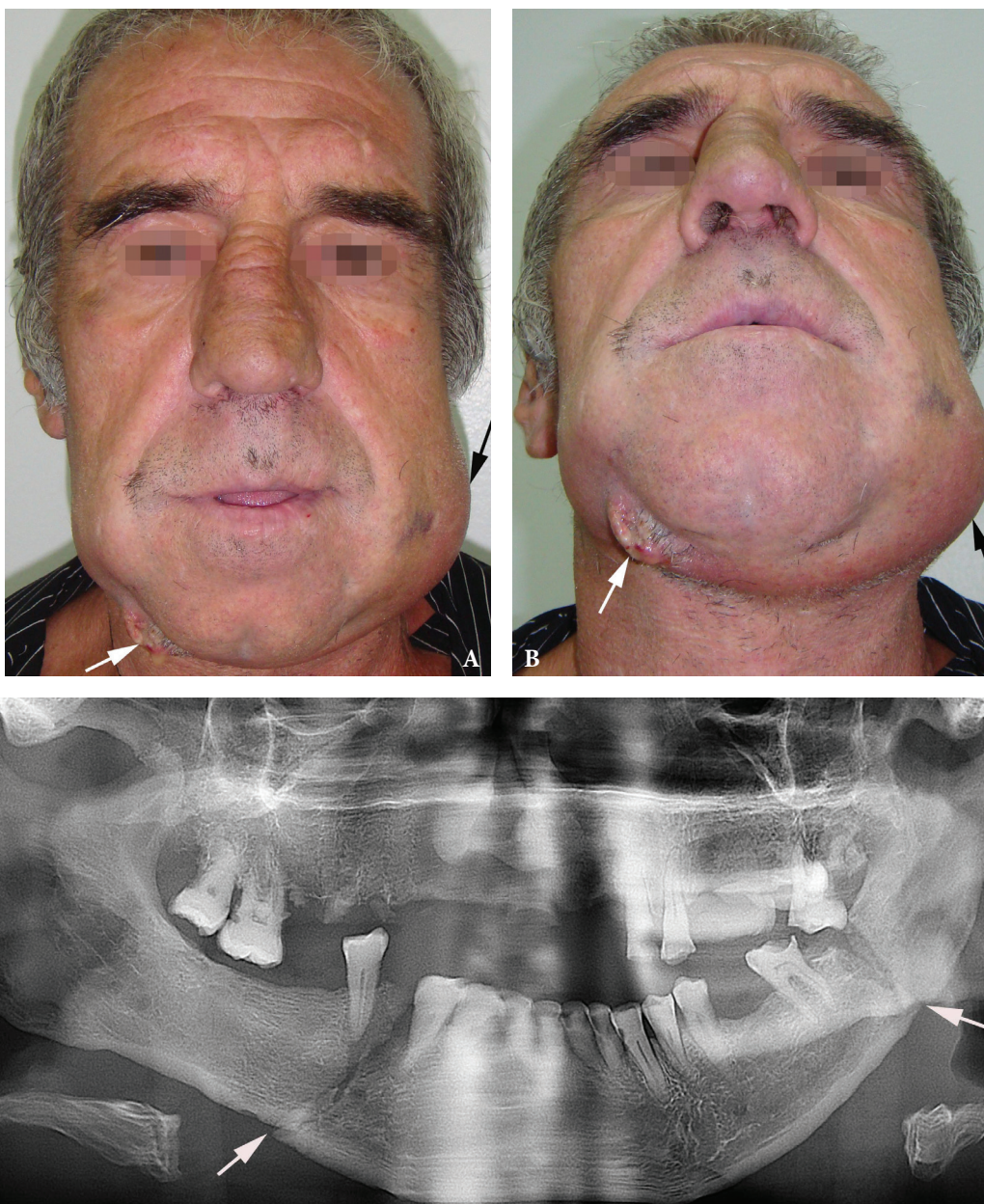
FIGURE 4. 42-year-old patient with two-week bilateral mandibular fracture complicated with osteomyelitis, skin necrosis and of abscess of soft tissues. On the clinical images (A, B) the skin necrosis with purulent discharge is indicated by white arrows, abscess – black arrows. Panoramic x-ray (C) shows mandibular fractures (arrows) with dislocations.