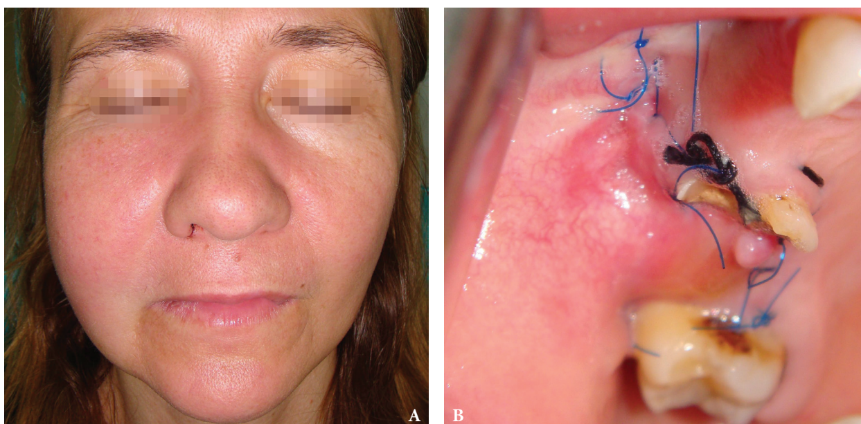
FIGURE 2. Suppuration of the blood clots in the maxillary sinus at 4 day after right-side highmorotomy. The patient complained of increasing of swelling at the right infraorbital and cheek regions, pain. At the clinical photograph of the patient noted hyperemia of the skin (A) and mucosa (B) at the area of surgery. The complication happened as a result of antibiotics rejection and inadequate treatment by non-steroid anti-inflammatory drugs by the patient.