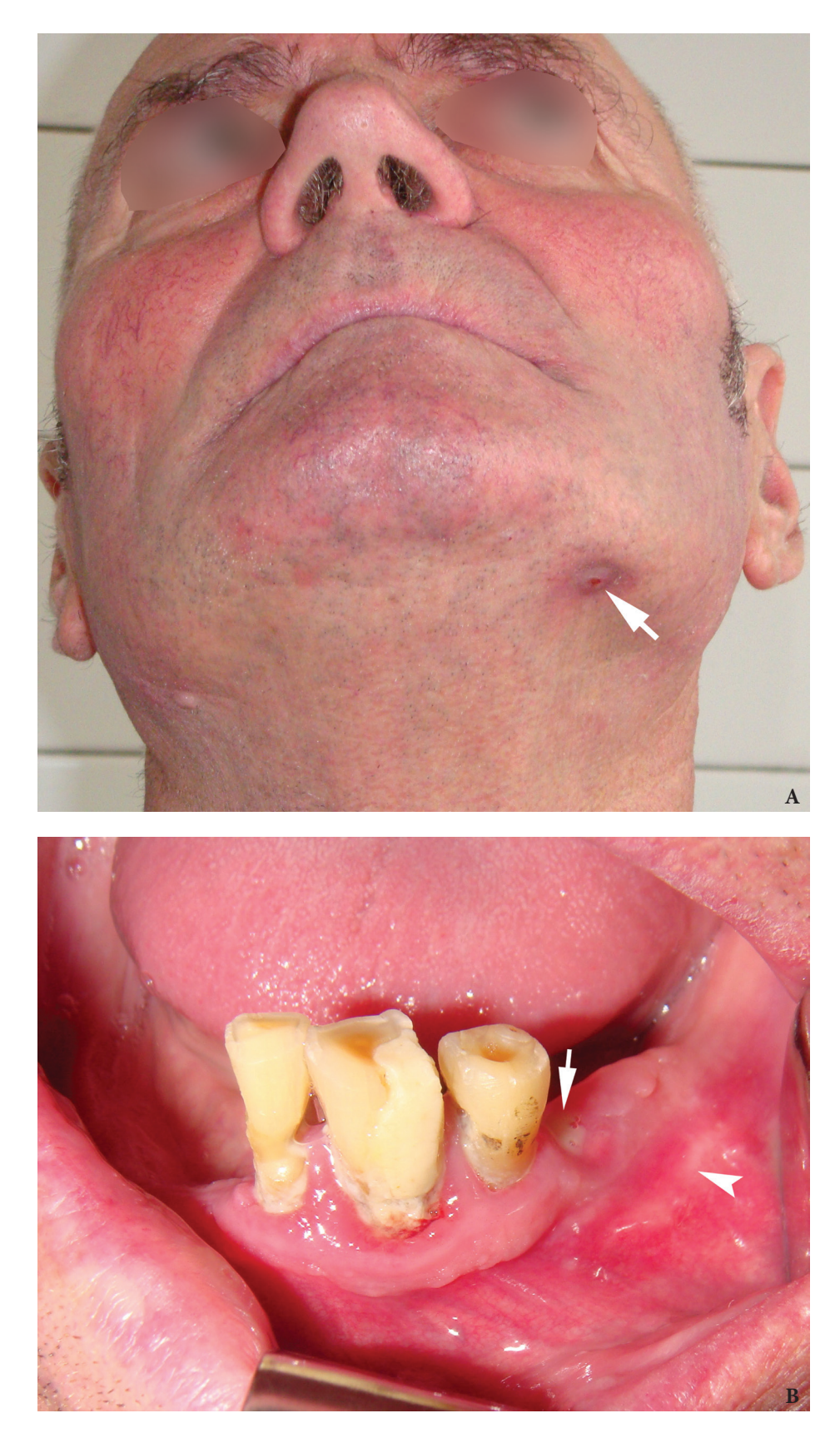
FIGURE 2. An extraoral ( A ) and intraoral ( B ) appearance of 70-year-old male with chronic odontogenic osteomyelitis of the mandible as a result of alveolitis (synonym: alveolar osteitis) after extraction of teeth 35, 36. On the image A is noted a skin fistula ( arrow ) at lower border of mandible. On intraoral view ( B ) a purulent discharge indicated by arrow , scar tissue after previously performed lancing of tissues by non-experienced surgeon – by arrowhead . Erythema of surrounding mucosa and extremely bad hygiene are also noted. ( Fig 2 continued on the next page. )