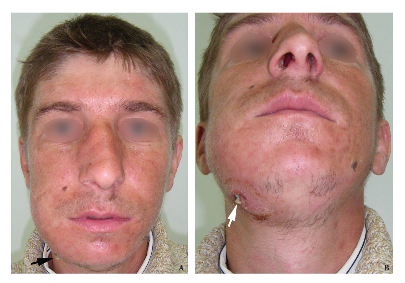
FIGURE 1. An extraoral (A, B) appearance of 27-year-old gentleman with acute posttraumatic osteomyelitis of the mandible as a result of two week trauma and bilateral fracture (right body and left subcondylar). Noted the swelling of soft tissues and cutaneous fistula ( arrow ) with purulent discharge. (Fig 1 continued on the next page.)

170 blood tests were analyzed for 11 signs, which are conditionally divided according to the severity from 0 to 3 points (Table 2), while 0 points correspond to the norm of the peripheral blood analysis for the Dnipropetrovsk region.