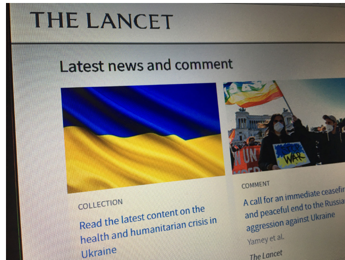
FIGURE 1. The Lancet is one of the most prestigious peer-reviewed publications among international general medical journals. Its Impact Factor is 202.731. Photo from the laptop screen as of April 8, 2022. 20

The Figures 1, 2, and 3 clearly demonstrate the international journals' contribution to the peace on European continent.