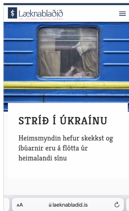
FIGURE 2. The Icelandic Medical Journal (Laeknablaðið) is an open access peer-reviewed publication of the Icelandic Medical Association and the Medical Society of Reykjavik: Smartphone screenshot as of April 24, 2022. 21,18 Homepage news translation from Icelandic: "War in Ukraine. The worldview has been distorted and the inhabitants are aloof from their homeland." 15