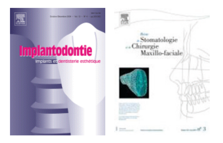
FIGURE 2. Cover of the Implantodontie (A) before incorporation in 2005 into a Journal – Revue de Stomatologie et de Chirurgie Maxillo-faciale (B).