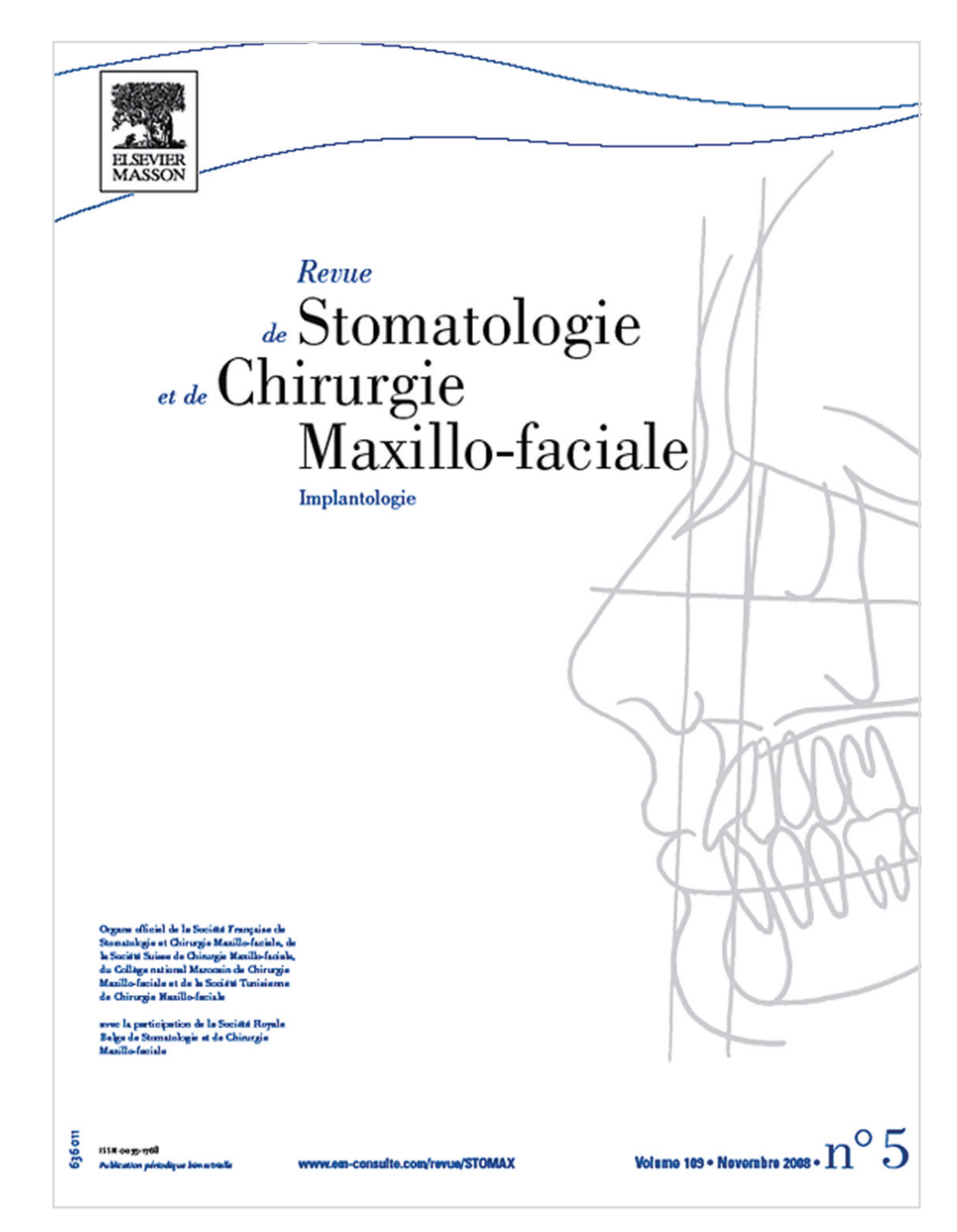
FIGURE 3. Cover of the French language Journal – Revue de Stomatologie et de Chirurgie Maxillo-faciale (Volume 109, Issue 5, November 2008) with a word Implantologie below the title what is indicated about incorporation of other French Journal, Implantodontie , with Revue de Stomatologie et de Chirurgie Maxillo-faciale .