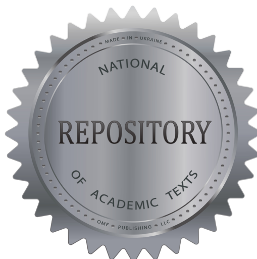
FIGURE 3. This silver stamp symbolizes that thanks to the joint efforts of the editorial board of the JDTOMP and the team of its publisher, OMF Publishing LLC, it became possible for the journal to enter the electronic database of the National Repository of Academic Texts (NRAT), Kyiv, Ukraine.

Developing a peer-reviewed journal is an inspiring but difficult task. However, it becomes easier if state institutions such as the NRAT are involved in this process. Therefore, we, as the editorial team of the JDTOMP , can recommend that other journals take advantage of the NRAT's capabilities and what they will provide in the future.