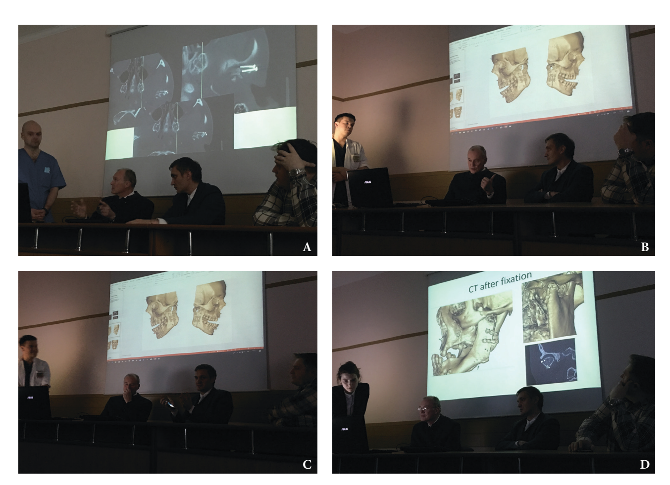
FIGURE 2. Case presentations ( A-D ) upon Round Table and discussion with an audience.